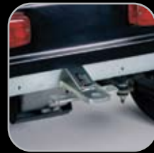
Trailer Hitch (Standard on Carryall 2)