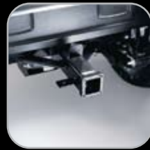
2-inch Rear Receiver Hitch