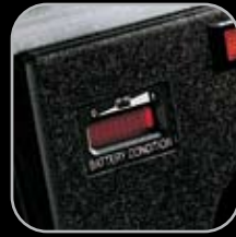
Battery Capacity Indicator