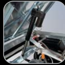
Electric Bed Lift