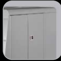
Industrial Van Box