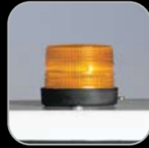
Safety Strobe Light