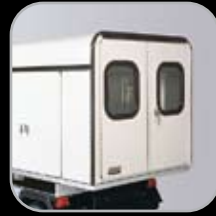
Custom Van Box