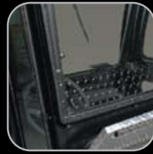
Cab Rear Glass