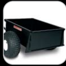
Swisher Dump Cart