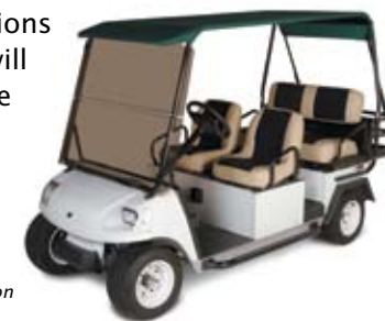
Carryall 2 with rear seat modification and luggage rack.

If you can dream it, we can build it. If you need something special to make your vehicles even more productive, the experts in our Custom Solutions department will tailor a vehicle solution just for you.