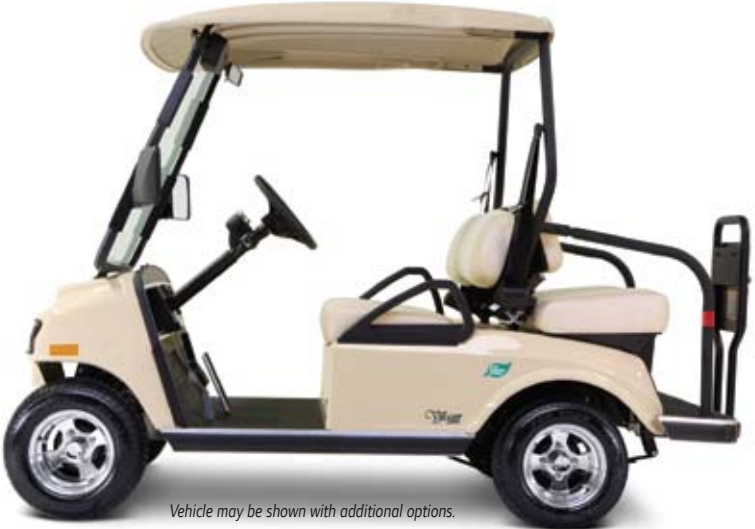
Vehicle may be shown with additional options.

Introducing the all new electric Villager LSV. It emits zero emissions, seats 4 passengers, costs just pennies per mile to operate, and helps reduce your annual operating expenses. Test drive one today and experience the thrill of a zero-emission transportation vehicle.